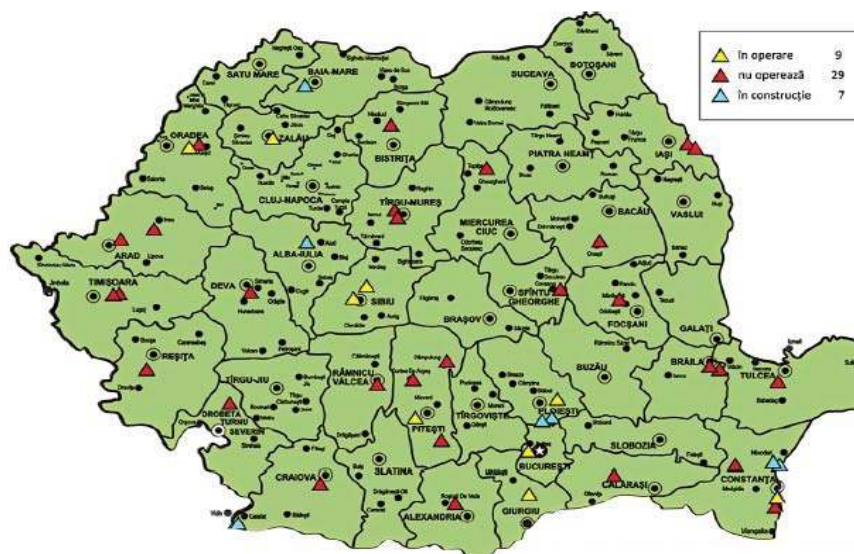
Figure no. 2. Map of compost depots in Romania